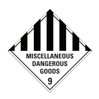
Figure 2: Li-ion batteries are classified as a Class 9 Dangerous Good

Packaging: The Australian Dangerous Goods Code (version 7.4) includes special provisions and packaging instructions for used and damaged Li-ion batteries.