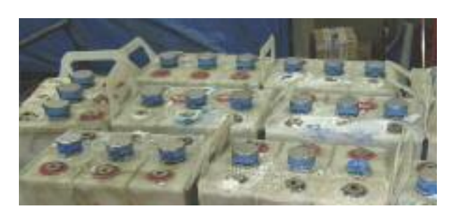
Figure 3: Nickel cadmium batteries

Health and safety: Follow manufacturers' quidelines for safe handling and storage.