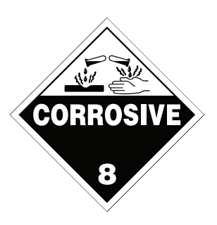
Figure 1: Lead acid batteries are classified as a Class 8 Dangerous Good

Packaging: ABRI has published a voluntary packaging standard at http://www.batteryrecycling.org.au/wp-content/uploads/2013/11/ULAB-packaging-standard-2013-final2.pdf