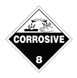
Figure 3: Nickel cadmium batteries are classified as a Class 8 Dangerous Good

Note: The information provided here is general in nature and provided for educational purposes only. Organisations must do their own research to understand their legal obligations and to ensure that they are compliant with all relevant laws and regulations. ABRI does not accept responsibility for any loss or damage occasioned by any person acting or refraining from action as a result of reliance on this document.